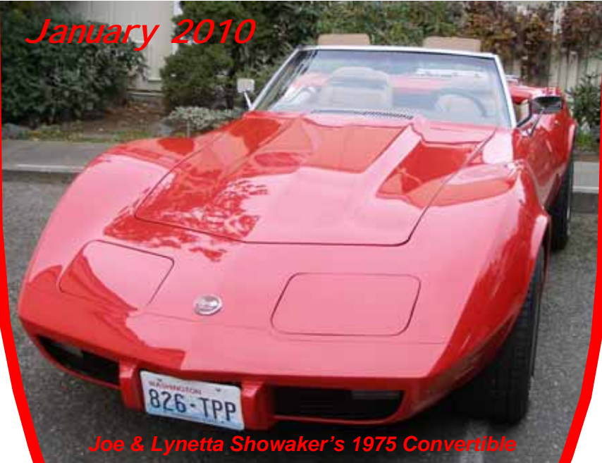
Joe & Lynetta Showaker's 1975 Convertible