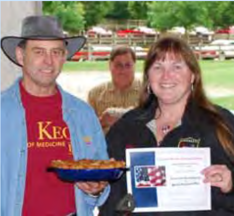
Best Overall Pie

The 4th of July Membership Picnic Pie Contest was a success. We had approximately 75 members show on a cool overcast day. We gave four awards in a field of about 19 pies. We were double stacking pies on an eight foot picnic table. That's amazing. Thanks to all those who took the time and energy to make a pie, you helped make this day truly a day to be remembered. Congratulations to the winners pictured below.