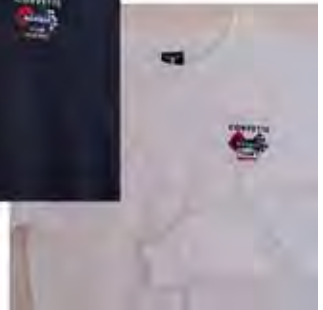
New Short Sleeve Pique Polo Shirt with Embroidered CMCS Club Logo

It is available in both women and men sizes ranging from XS-4XLT for $30 ($5 additional charge for tall and sizes 2XL and larger).