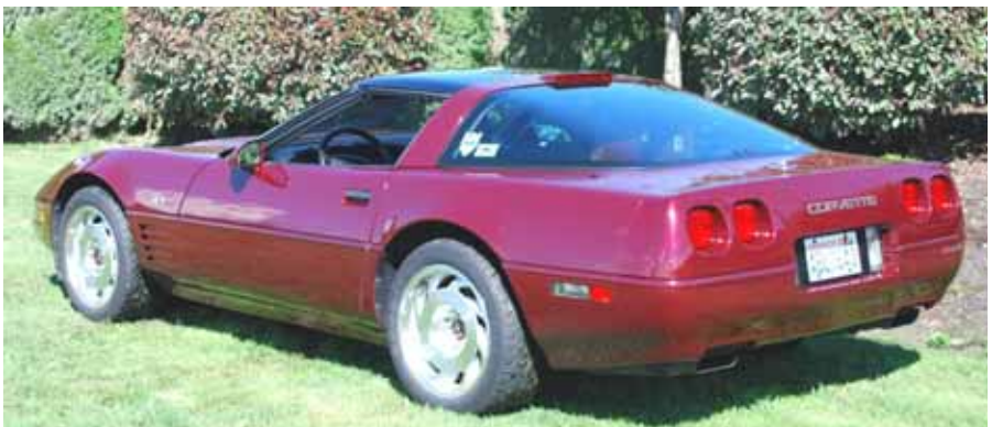
1993 40th Anniversary Ruby Red ZR-1