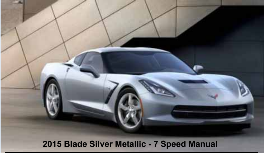
2015 Blade Silver Metallic - 7 Speed Manual