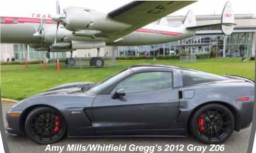
Amy Mills/Whitfield Gregg's 2012 Gray Z06